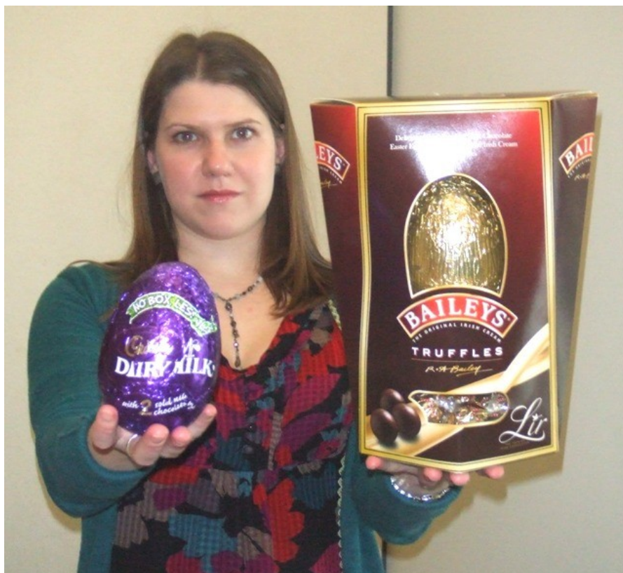
Bailey's Easter egg packaging: minimum necessary?

Clearly, excess packaging and the need to reduce green house emissions is not just an issue with Easter egg packaging, but one which affects many of the products we buy every day. Easter eggs present some of the most obvious examples of over-packaging in the food industry, and their annual appearance on supermarket shelves provides a good opportunity to review what progress has been made in the year gone by. This year as well as looking at the weight and volume of packaging Easter eggs are also ranked according to percentage of their packaging which can be recycled.