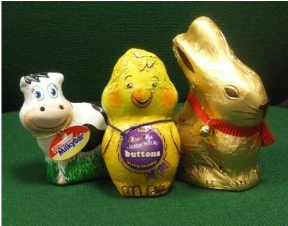
The Nestlé Milkybar cow, Cadbury's chick and Lindt bunny

In the 'highest volume of egg to volume of packaging ratio' column, the volume of the egg has been used rather than the volume of all edible contents because in most cases the other contents could be put inside the egg. Where we have measured two different eggs of the same brand, the brand's ranking was worked out from an average of the measurements of the two eggs.